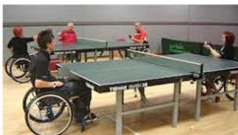
Table Tennis. Play with friends or in competitions